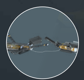
NEXT Level Electrification -Machine2Machine Communication