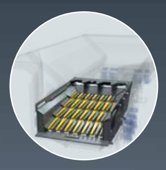
Patented innovation: RM Active Grid® - up to 30 % higher throughput