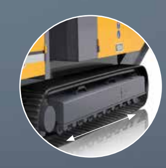
Track and crush at the same time