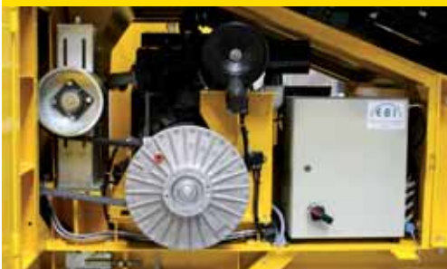
Efficient automatic 2-step conveying and diesel / electric drive (2,4 to 3 gallons per hour / 9 to 12 litres per hour)

RUBBLE MASTER Compact Recyclers are the compact class when it comes to mobile processing: they are versatile in use, powerful and stable in value. RUBBLE MASTER Compact Recyclers produce high quality aggregate from construction debris and natural rock; on-site and cost effective. Thanks to the compact dimensions and low weight, RUBBLE MASTER equipment can be transported without special permits. Proven technology and one-on-one consultations from the RM Lifetime Support enable the RUBBLE MASTER user to offer competitive rates with exceptional service while creating a strong, profitable business. Our key to success is successful customers.