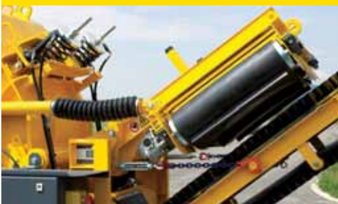
Indispensable: release system to remove blockages, plus reliable magnetic separator