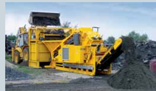
Reduced wear through optional pre-screening: the robust VS60 – also available with side conveyor belt – separates fines from the feed material

service jobs can be carried out from ground level. With optional high-performance components such as pre-screens and final screens, you can create a complete recycling centre. The building, paving or demolition contractor becomes a service provider for companies and communities by creating clear, cost-efficient recycling loops. RUBBLE MASTER partners across North America and around the world offer support and advice on optimum settings and site logistics on a case-to-case basis.