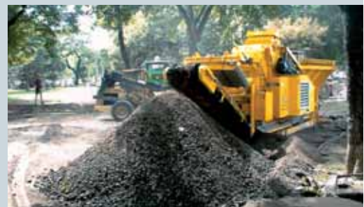
Success factor quality: up to 88 short tons / 80 metric tonnes per hour cubic shaped value aggregate from building debris, asphalt, concrete, bricks and other mineral material