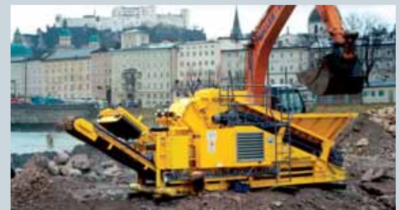
Appreciated by residents: thanks to series dust suppression and noise reducing cover