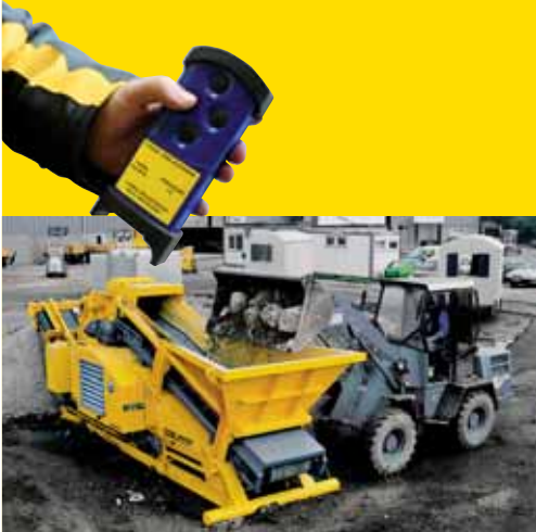
Easy handling: Fed with small construction loaders (loading edge 75" / 190 cm), remote control optional