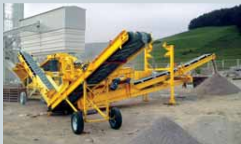
Profitable niches: recycled production waste can be screened with the container-mobile CS2500 (one-deck or two-deck) into high-value final products